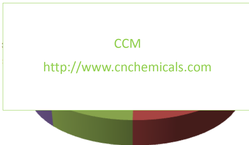
Figure 2.1-3 Share of number of registrations of pesticide formulations in China by category, as of 19 April, 2017