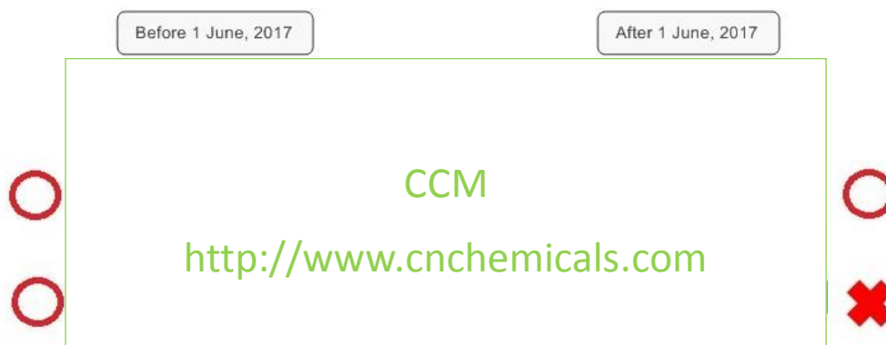
Figure 2.1-1 Differences between formal and temporary registrations before and after 1 June, 2017 in China